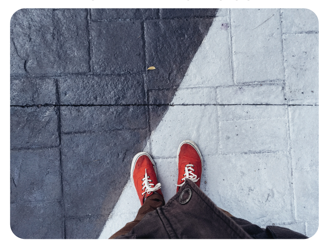
"Therefore, come out from among them and be separate, says the Lord; do not touch any unclean thing, and I will welcome you".